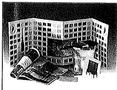
Historic Colors of America, a palette of 149 authentic period colors

In 1996 Historic New England partnered with Color Guild to create Historic Colors of America , a palette of 149 authentic paint colors ranging from Colonial to Federal to Greek Revival to Victorian to Twentieth-Century Eclecticism.